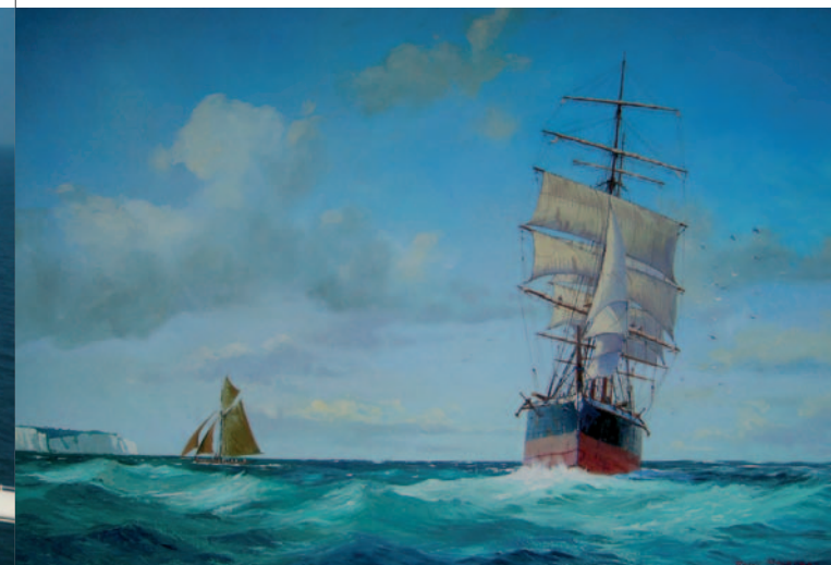
'PILOT ON BOARD' BY RONNIE MOORGAT RSM