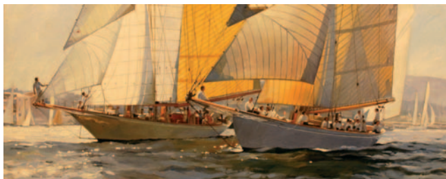
'SUNSHINE & MOONBEAM IV' BY ROWENA WRIGHT RSM

The Mall (near Trafalgar Square), London SW1