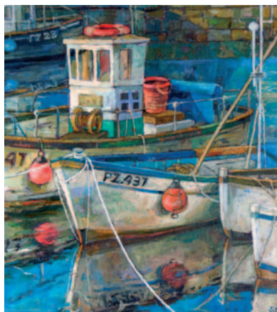
'BOATS AND ROPES' BY SONIA ROBINSON RSMa

The society has many links with the maritime world, including the National Maritime Museum, the Royal Navy, the RNLI, the shipping industry, publishing, sailing and sail training interests. As a registered charity it is committed to promoting marine art of the highest quality.