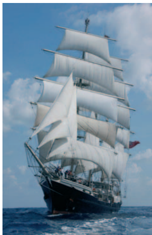
SV TENACIOUS UNDER FULL SAIL

The Jubilee Sailing Trust is unique. Established in 1978, our aim is to promote the integration of people (aged 16+) of all physical abilities through the challenge and adventure of tall ship sailing.